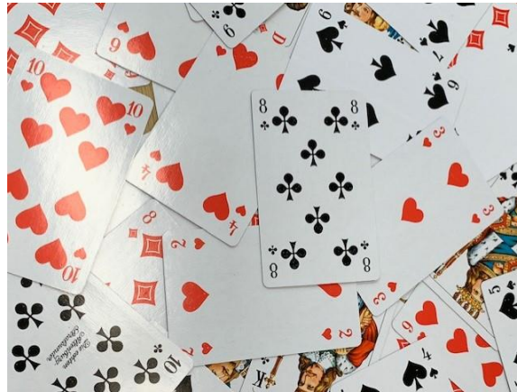
Fig.2: Chaotically scattered cards

To get an idea of how large this number is, let's make a comparison with the following example: Suppose we throw a deck of cards from the minaret of the Bey's mosque in Sarajevo into the mosque courtyard. The cards will, at random, be scattered all over the yard, falling on the face or on the back; it will rarely happen that one card touches another. Imagine someone telling you how he managed to throw the cards so that they fall on top of each other, all 52 cards, exactly matching, and so that they are all turned to face, with so arranged that first 4 aces, then 4 on them deuces with the same arrangement of color and sign as aces, then 4 triples, and so on until, finally, with 4 kings. At the end we have an initial, nicely stacked, deck of 52 cards. There is no one of us who would believe this story, who would allow a doubt of such a possibility, even assuming that there have been billions of throws through billions of years! Simple: it's impossible!