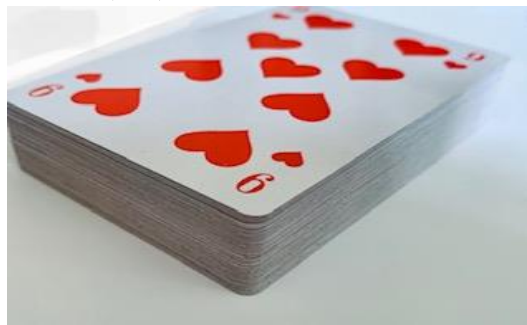
Fig.3: A stacked deck of cards

(10)^{360} is a huge, incomprehensibly large number, a number that is written as 1 and 360 zeros! We don't have a name for this number, and we never encounter it. This is exactly in line with our perception of this example: it is not possible that cards stack into a deck when throwing a card, even if we do it billions of times a day ( 10^9 ), billions of years ( 10^9 ).